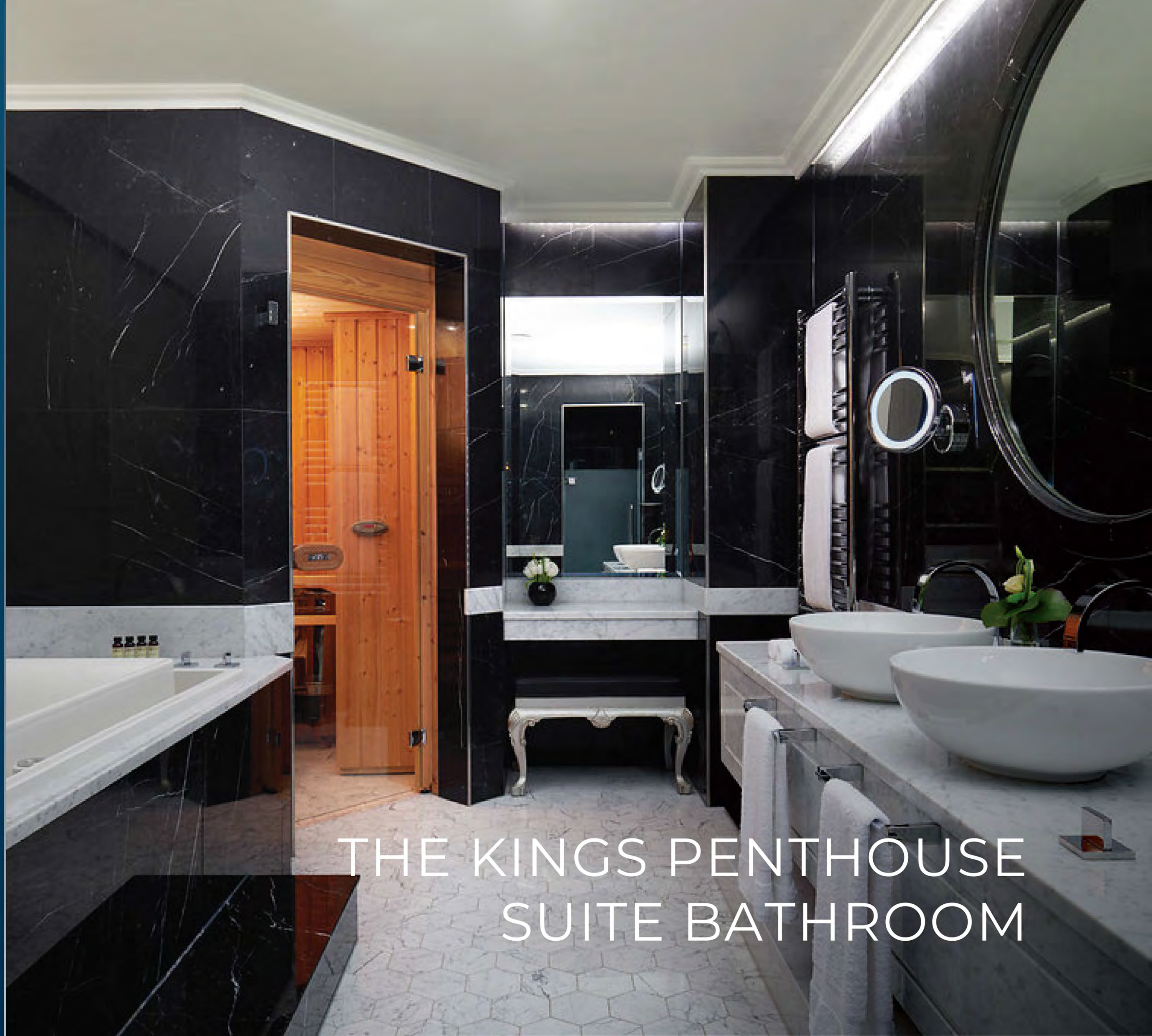
THE KINGS PENTHOUSE SUITE BATHROOM