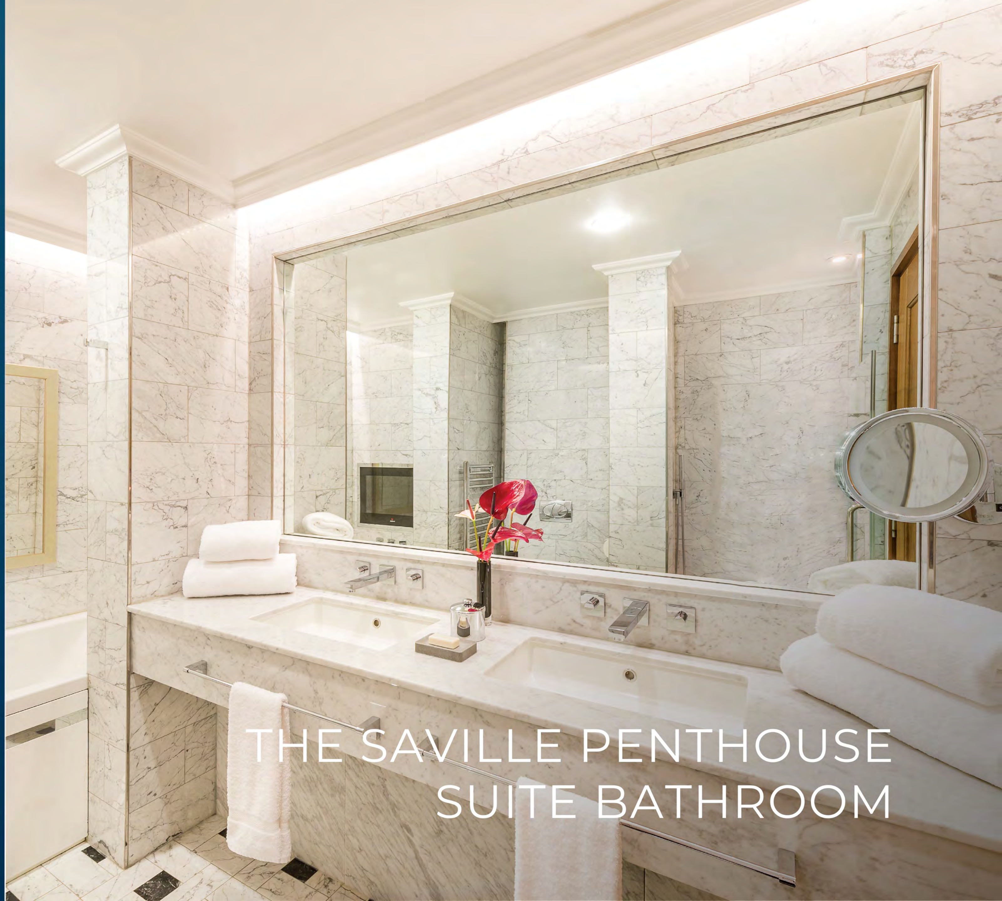
THE SAVILLE PENTHOUSE SUITE BATHROOM