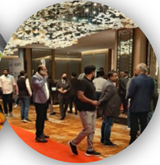
Opulent foyer setting the stage for your events