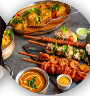
Curated menu for both North and South Indian Cuisine